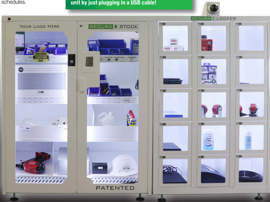
STOCK / ADD-ON LOCKER

Add 15 high security lockers to your SecuraStock unit by just plugging in a USB cable!